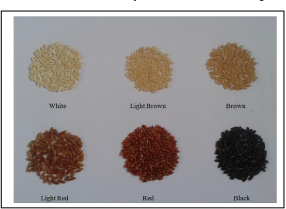
Decorticated grain: colour