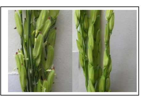
lemma: anthocyanin colouration of apex