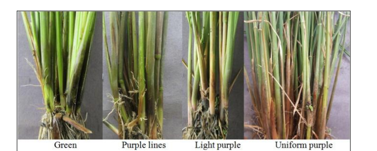
Basal leaf: sheath colour

Int. J. Pure App. Biosci. 5 (4): 466-475 (2017)